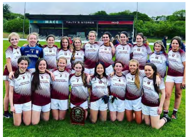
U16A Shield winners