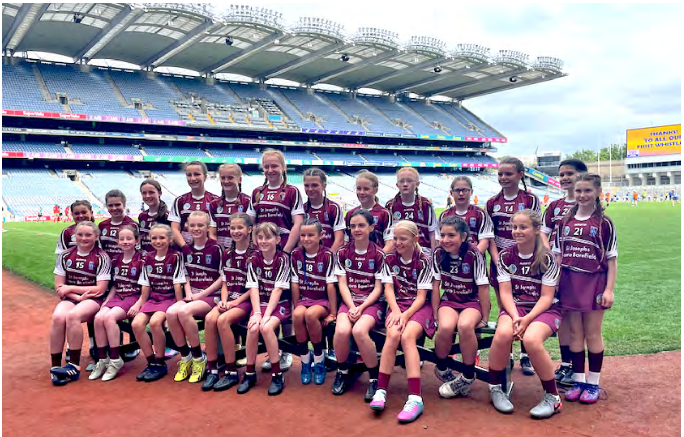
(Great picture of the players at the pitch with Croke Park backdrop in all its glory)