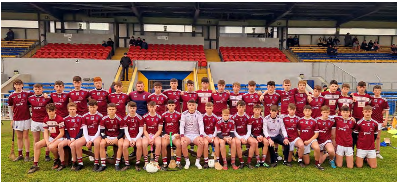
U16 Hurling County Champions