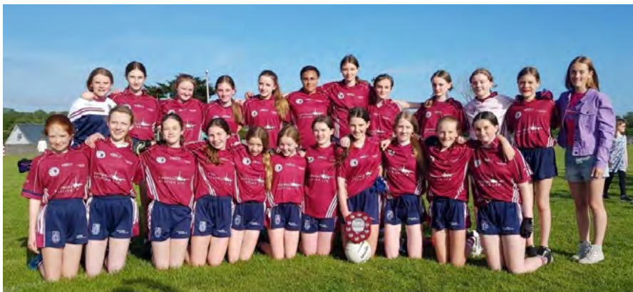
U14 League Division 4 winners

The membership during the year was in excess of 45 members and training in the year commenced in January 2022.