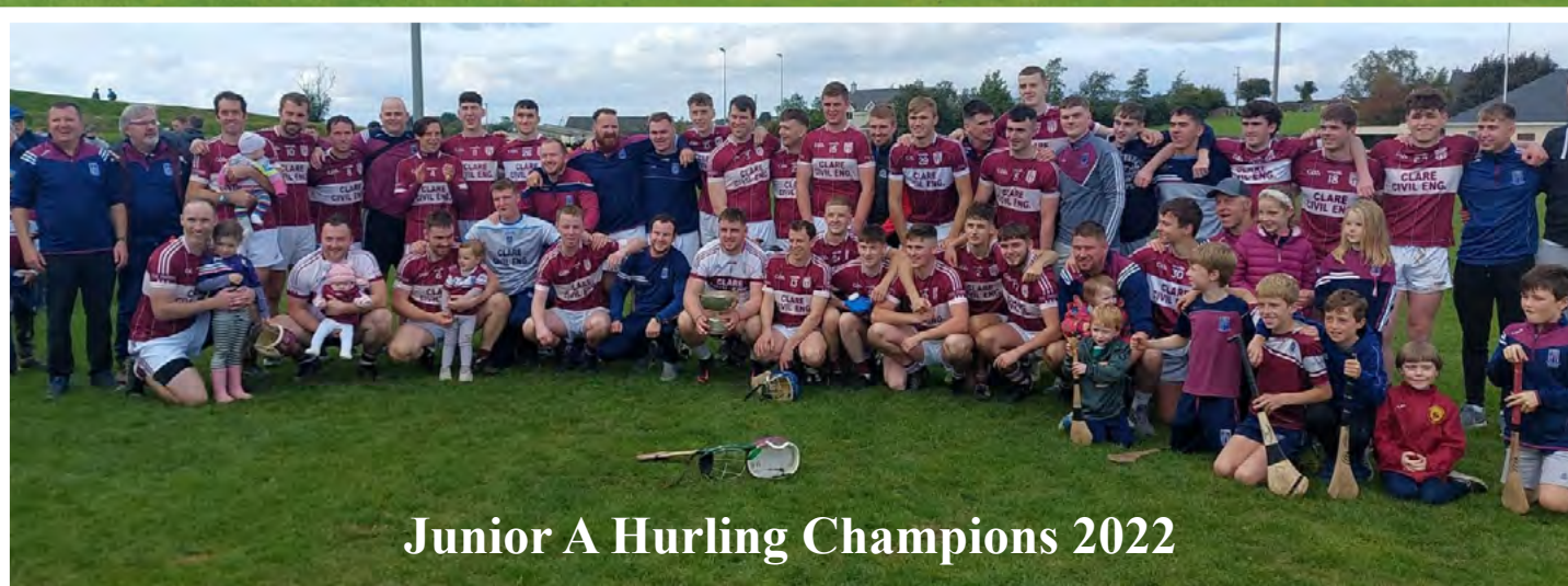
Junior A Hurling Champions 2022