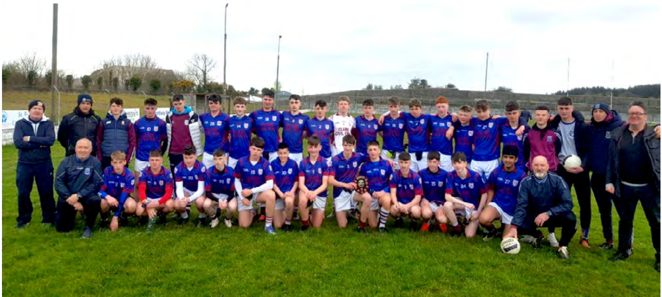
U 17 league football champions 2022

We can look forward to seeing some great times in the future with this crop of players. Thanks to everyone, both players and parents for all the efforts during this season. On behalf of the football management team, we would like to wish you a happy Christmas and successful 2023!