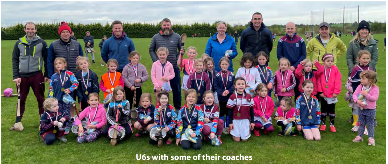
U6s with some of their coaches