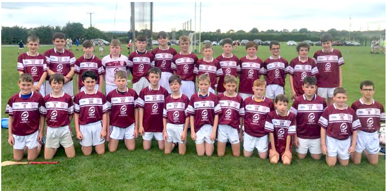
U13 A Academy Shield Winners