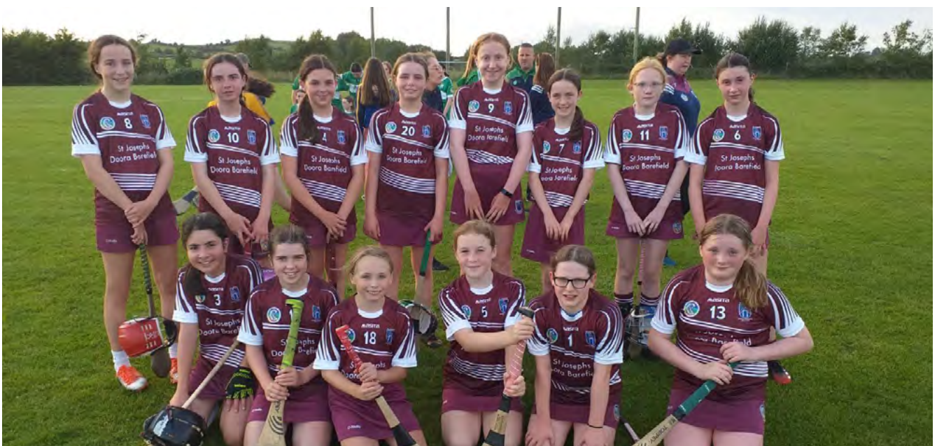
U13 DIV C team

Our Academy team had victories over Cratloe and Sixmilebridge in all their games. Overall, we saw fantastic improvements in all the girls' skills as the season progressed.