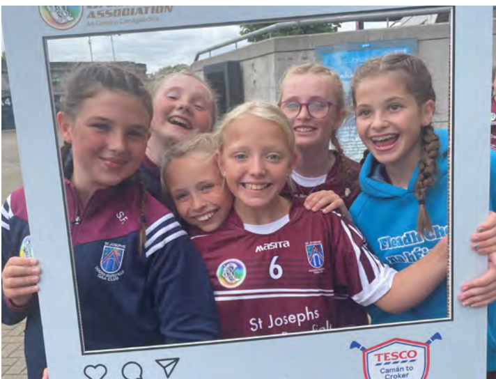
Happy Camogie Players !