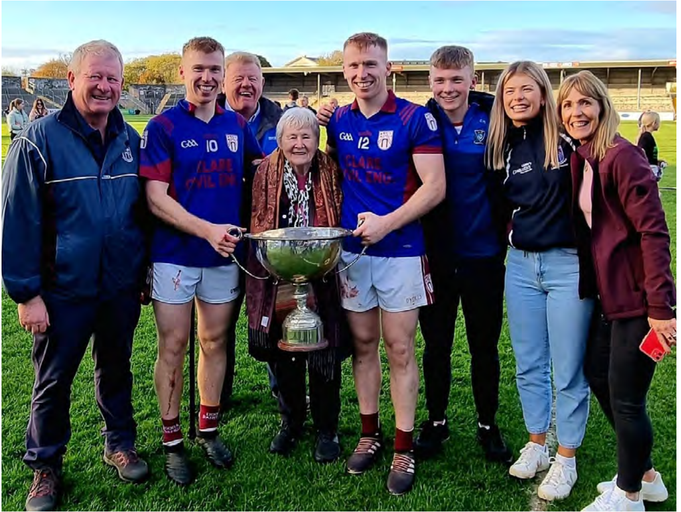
3 generations of the Hannon family celebrating in Cusack Park