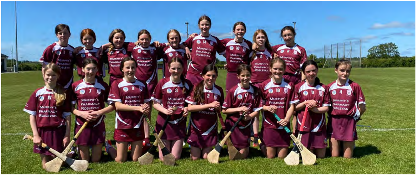
U14 team picture