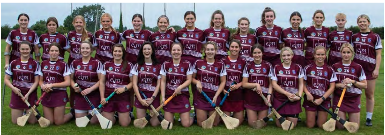
Full Adult Panel 2022