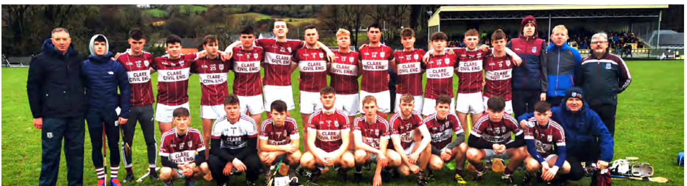
U21 c county hurling finalists 2022