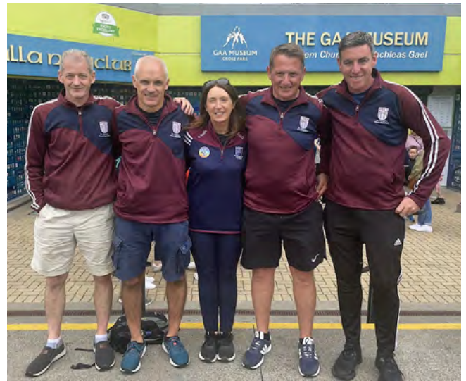
Some of the Coaches ( Right ) and Supervisors ( Left ) who organised the trip and managed everything so well on the day.