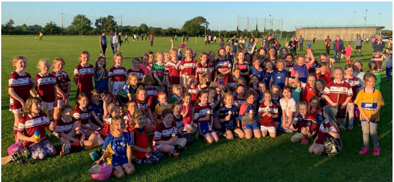
U8s... just before they got the ice-cream cones!