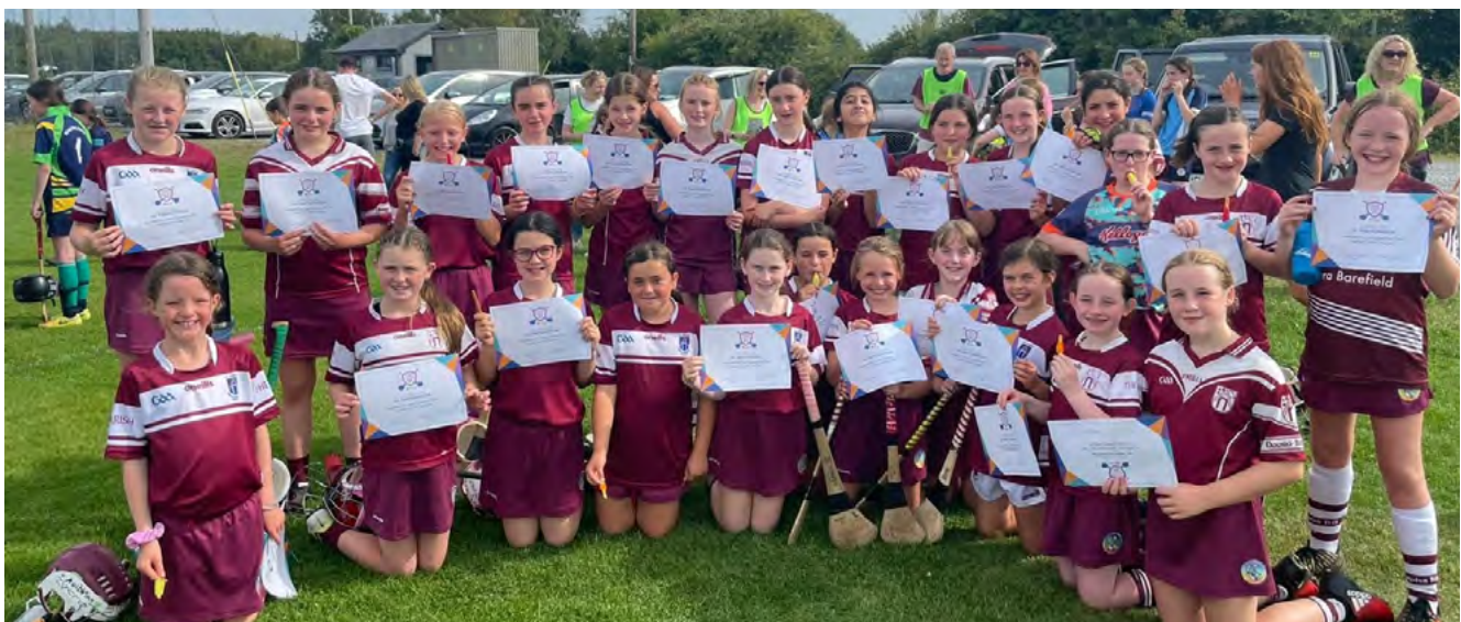
U12s with their Participation Certs at the TESCO Fun Day