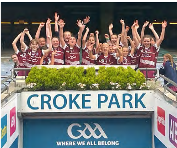
Hopefully, these great players will be back at this spot some day in the future collecting a cup !