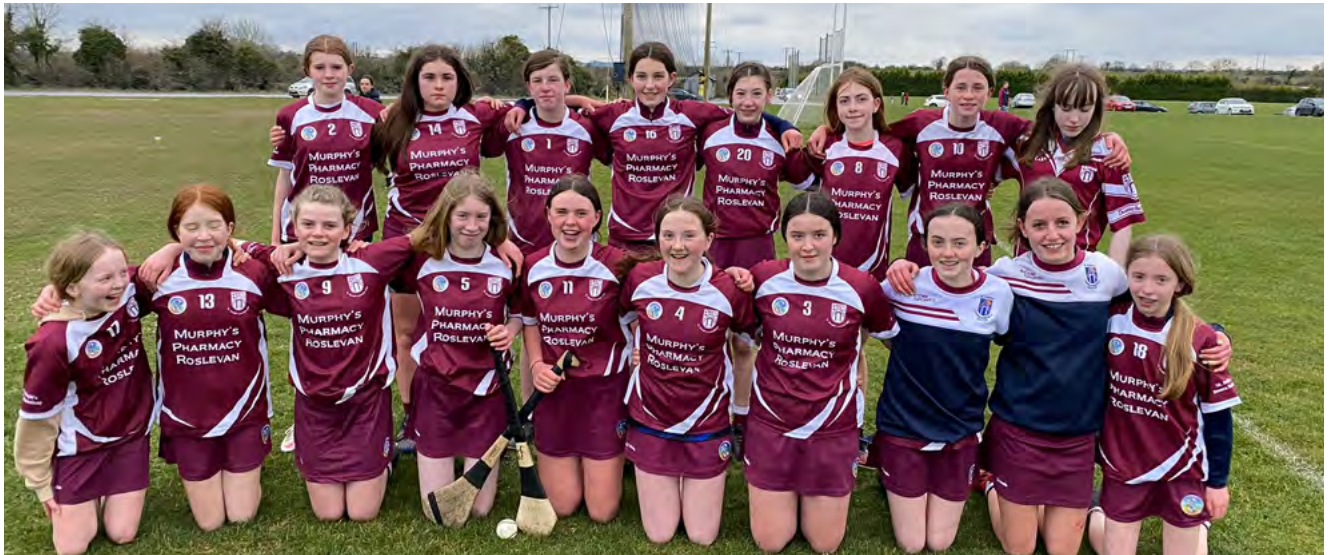
U14 team picture