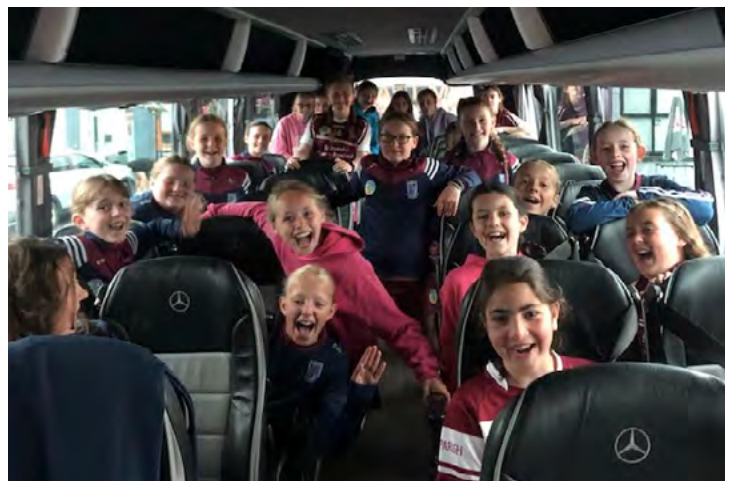
The bus up and down to Dublin was just the best craic !