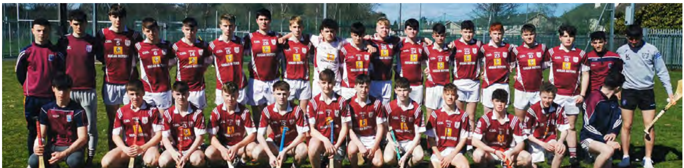
U17 minor a hurling county finalist

The Minor championship commenced in July and over a two month period we played seven championship games at the end of which we finished 2nd in the table behind Clooney Quin. This meant we qualified for the semi-final against Clarecastle and this game was played in Newmarket in late September. This was an excellent game of hurling with the lads playing really well to win by 5 points. We then met Clooney Quin in the Minor Championship final which was played on 9th October in Cusack Park. The weather was miserable on the day as it rained persistently all through the match and conditions were really difficult. However both teams put in a tremendous battle and the game was level at full time which meant extra time.