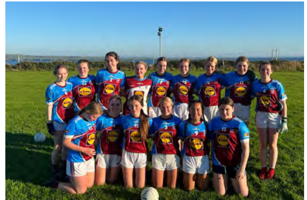
Junior A team

Our A division team played Kilrush, Fergus Rovers, West Clare Gaels and Miltown winning 3 out of the 4 games to finish second in the table. We then played Miltown in the semi-final but unfortunately lost out by 2-09 to 2-07. We qualified for a shield final against Fergus Rovers and defeated them by 2 points to win the Shield.