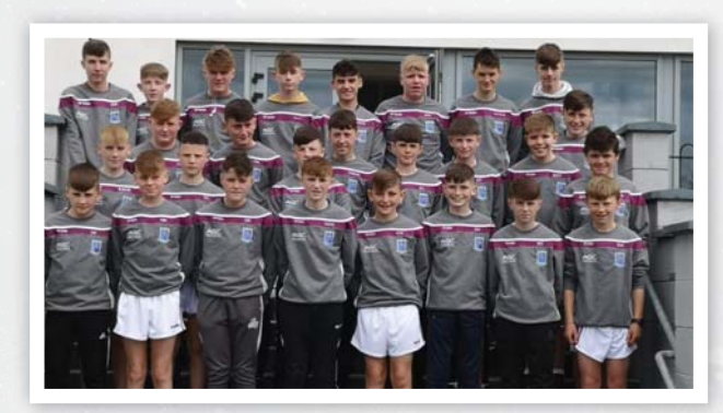
Doora Barefield U14A team, Clare Feile A Winners and Clare U14A Championship Finalists

Old rivals Clooney Quin provided the opposition in the U14 A final. In a game coming just four days after the tough semi-final win over Kilmaley, our lads unfortunately just couldn't match the energy and hunger of a fantastic Clooney Quin side that ran out easy winners in the end. After losing to Doora Barefield in the previous year's U13A final and this year's Feile A final it was always going to be a difficult task to win but our players did us proud battling all the way to the final whistle. Final score Clooney Quin 2.16 Doora Barefield 1.05