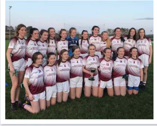
U14 A Ladies Football Champions