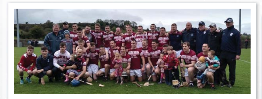
Junior B Hurling County Champions

What an amazing year 2019 has been in hurling, camogie and football. Here are some of the highlights!