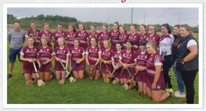
Minor A Shield champions.