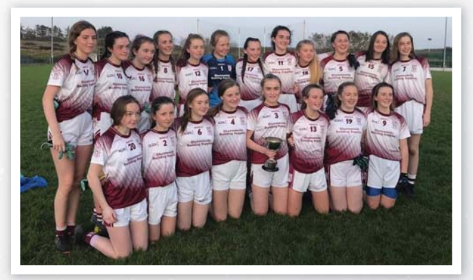
Ladies Football U14A

For 2019 we had 46 U14 girls signed up for training.