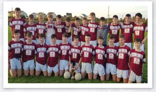
U14 Football Champions