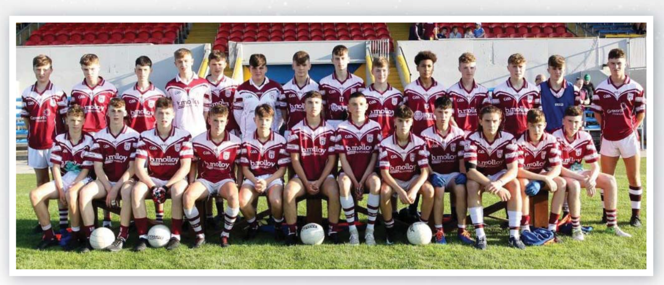
U 16 Football County Champions