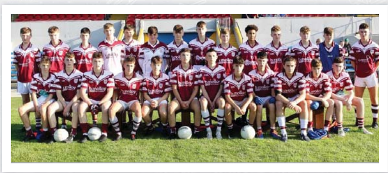
U16 Football Champions