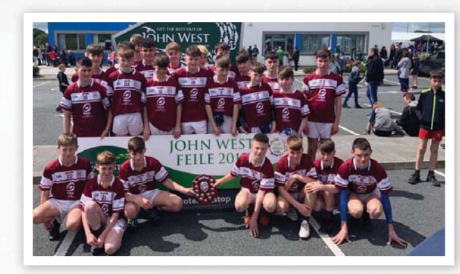
U14A Academy Team Champions

13.03.19 Doora Barefield 4-08 Ballyea 0-08 (FINAL)