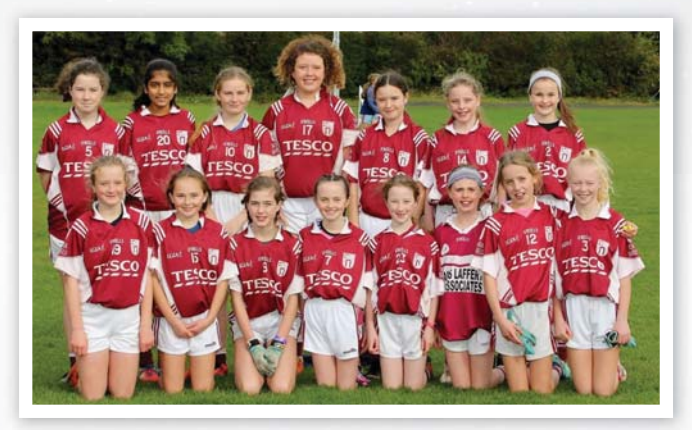
Ladies Football U12