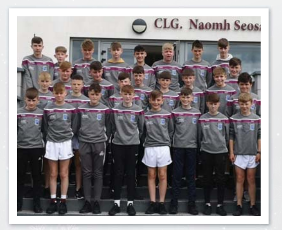
U14 Hurlers Clare Féile A Winners & Clare U14 Championship Finalists