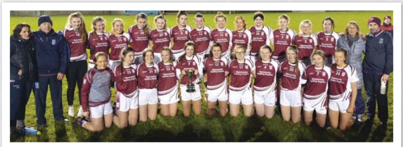
Ladies Minor Football Champions