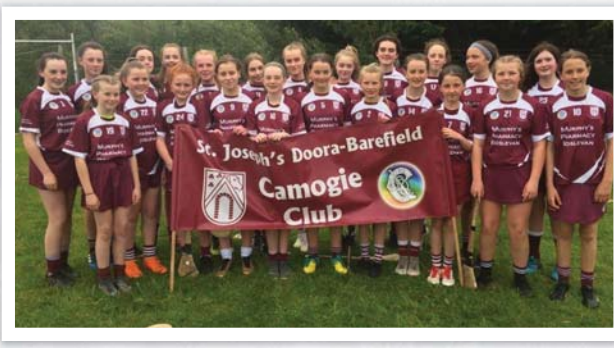
U14 B Shield Champions

Training for the St. Josephs U14 camogie commenced on 3-February. The panel consisted of 24 players including 3 stronger U12s. From February to the end of May, the panel had 36 training sessions or games.