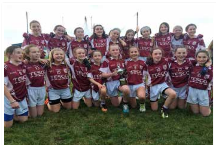
U12 A Girls Football Champs