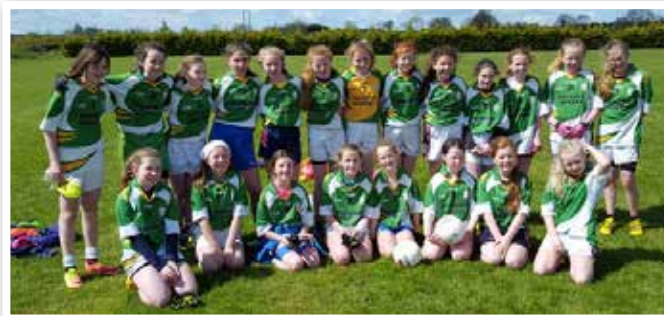
7 a-side runners up Knockanean School

A Football Championship, both the U 14 boys and girls football teams on their success in the All Ireland Feile competition in Cavan/ Monaghan in June and the U12 A girl's football team on their championship success, many of whom are pupils in the school. A sincere thank you to the club for the continued use of their facilities both for training and for matches.