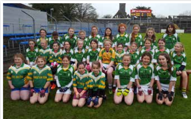
Div 1 Girls Finalists Knockanean School