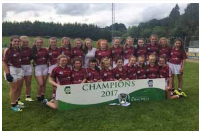
Under 14 Grils Feile Front Page