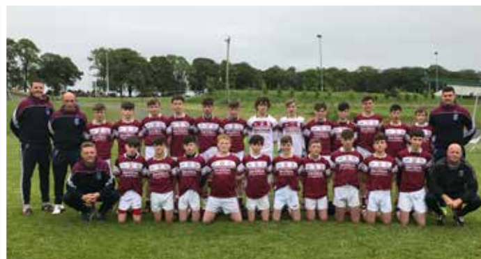
All Ireland F-éile boys winners 2017

2017 was an extremely busy year for the U14 football squad. We began training in early January in preparation for Féile. In the run in to the county competition we played a series of challenge matches against Mungret, Monaleen, Corofin (Galway) and Claregalway. We also hosted Castlebar Mitchells, Portlaoise and Austin Stacks in a tournament in Gurteen, we then travelled to Portlaoise for a return tournament where we played the host club, Coralstown/ Kinnegad and St Broughans (Offaly). In the group stages of the county competition we defeated Clondegad and Corofin and in a very tight final we defeated Ennistymon.