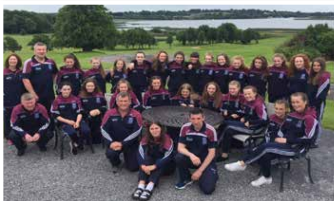
U14 Girls Feile Champs