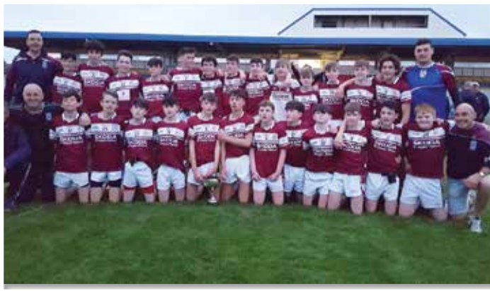
U14 Div I Champions