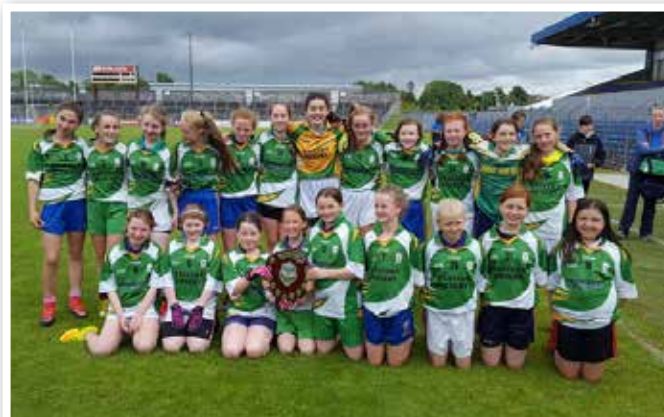
LGFA Div 1 champions Knockanean School