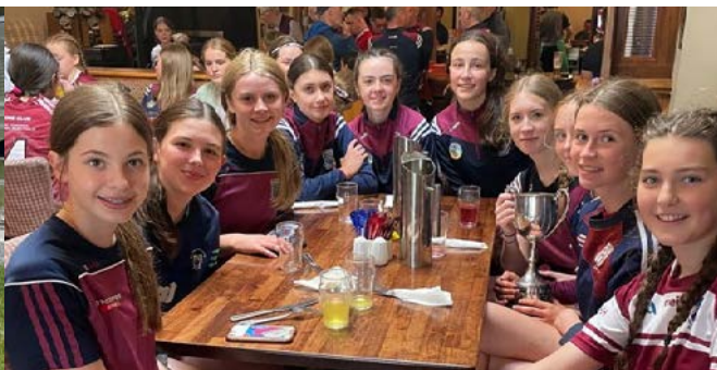
The team relaxing after the game