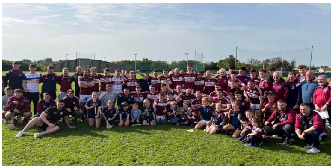
Junior C Premier Champions 2023