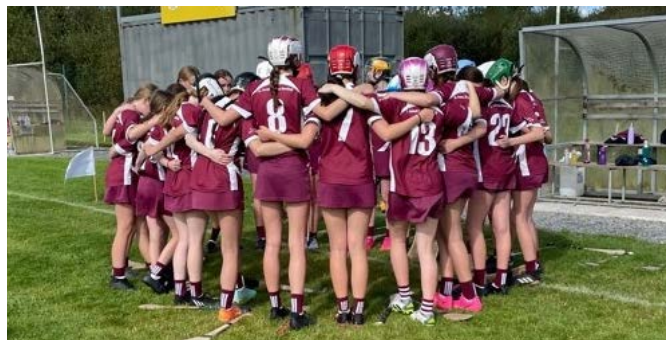
The team focussing before the game

During the year this particular group had two bonding sessions. The first was held in Gurteen where the girls engaged in thought provoking activities about the values they would identify and practice for the remainder of the season.