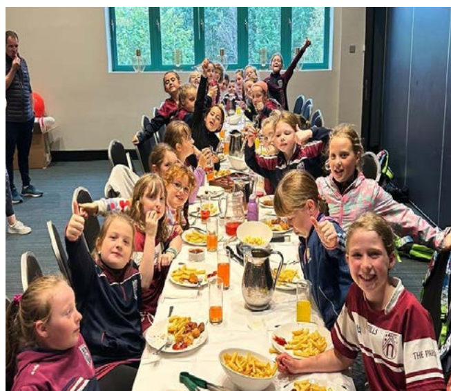
Nice food after the Climbing Wall trip