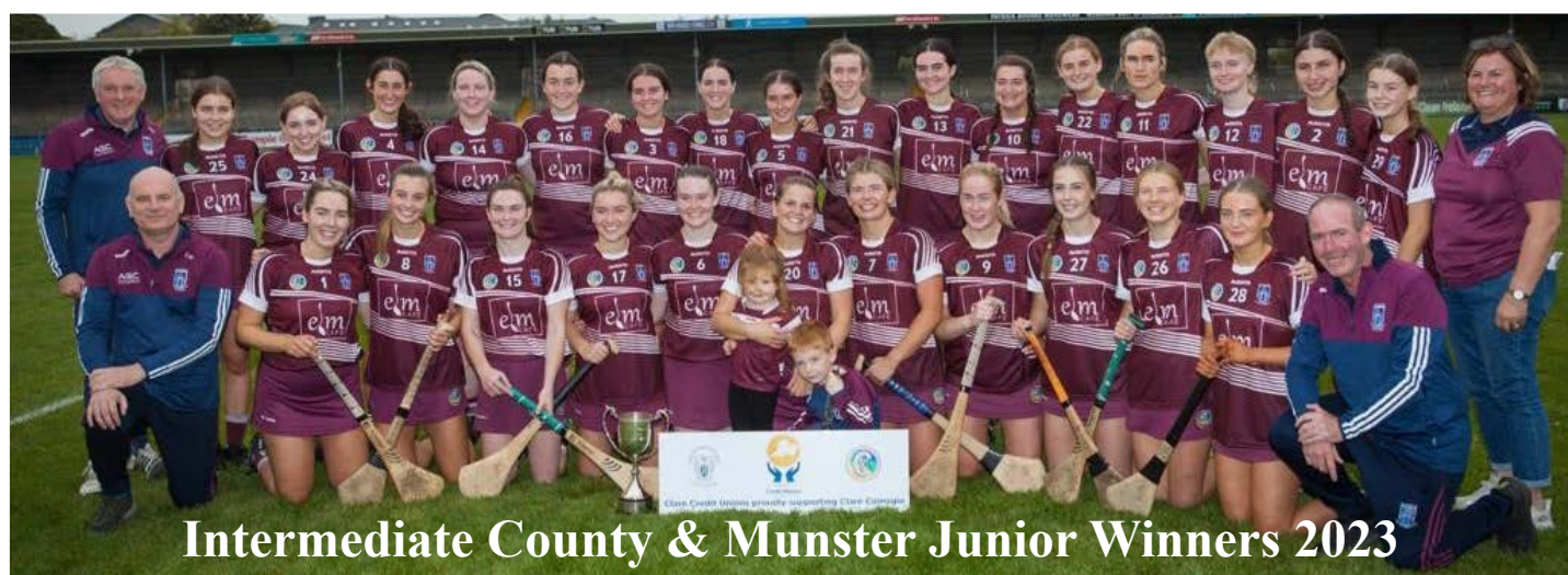
Intermediate County & Munster Junior Winners 2023