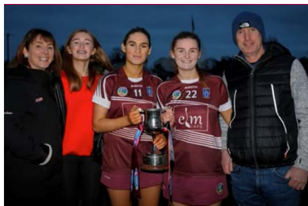
Behind every great player are dedicated parents !