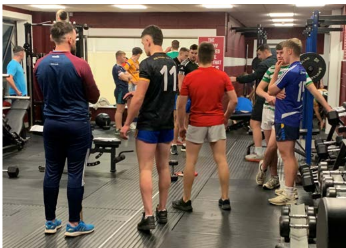
New Gym Gurteen