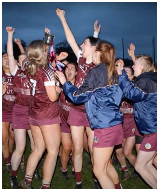
The Joy of winning with your Club