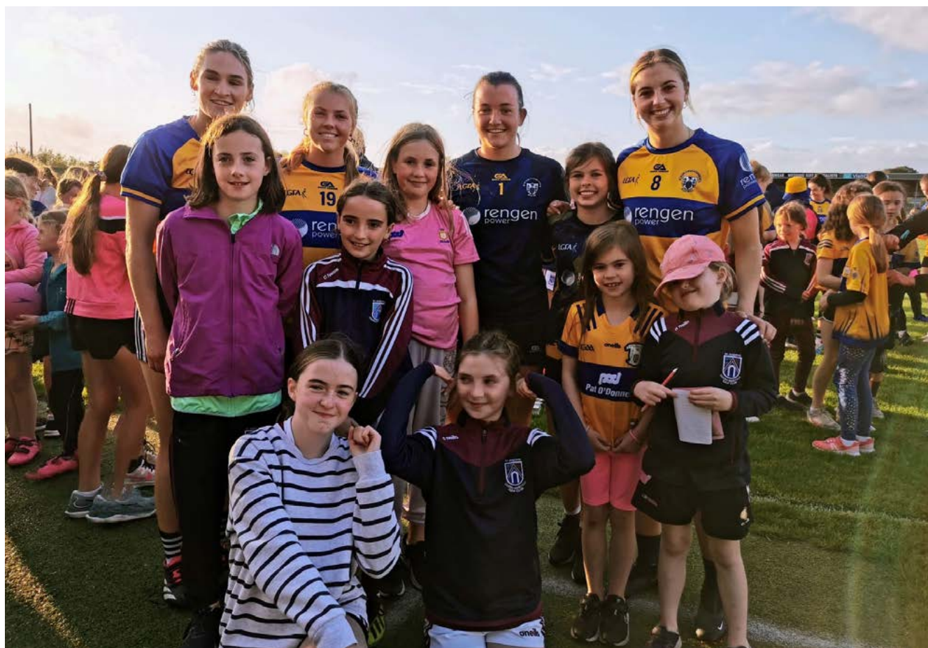
U13 DIV C team