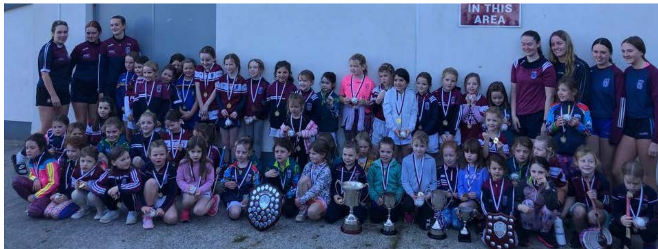
U6 & U8s at their last day of Camogie with some of the older players and their Trophies