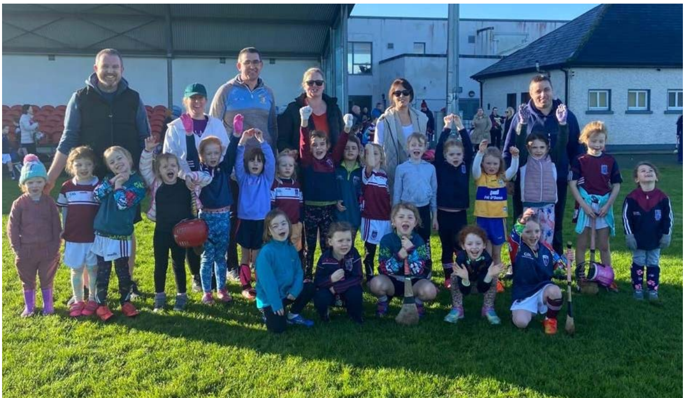
U6s with some of the Coaches.

On behalf of the coaching team, we wish you a merry Christ-