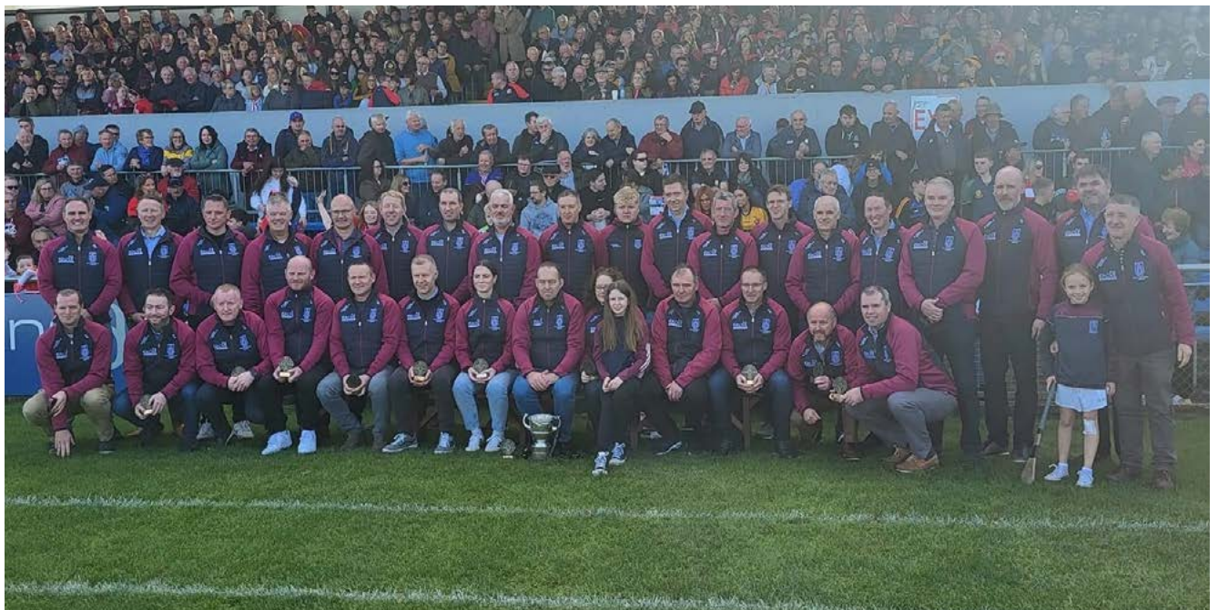
98/99 County Champions, Munster Champions and All Ireland Champions been honoured in Cusack Park at this year's county final