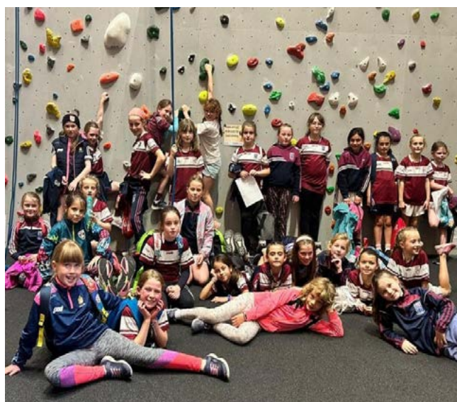
U10s at their Wall Climbing day out in UL