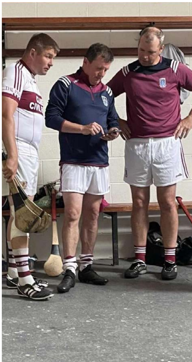
Our Intermediate Team coming out of retirement