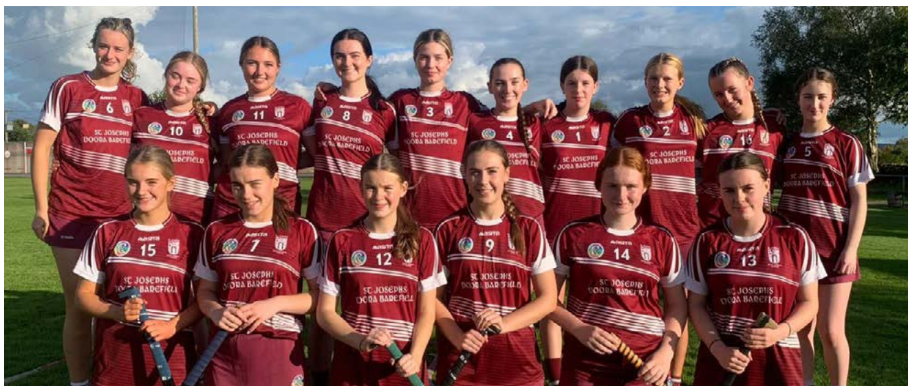
U18 Team Photo ahead of the Shield Semi Final V Whitegate