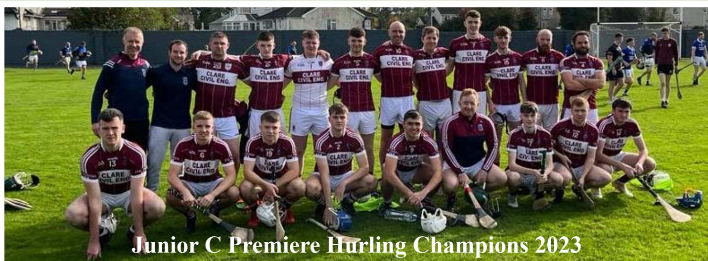
Junior C Premiere Hurling Champions 2023