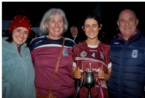
All great teams have great supporters. Some ( above ) never miss a game ...