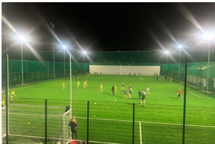
First Session under lights on the new astro turf