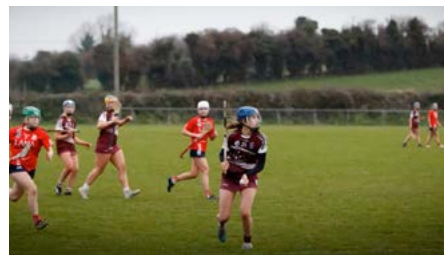
Duggan wonder point