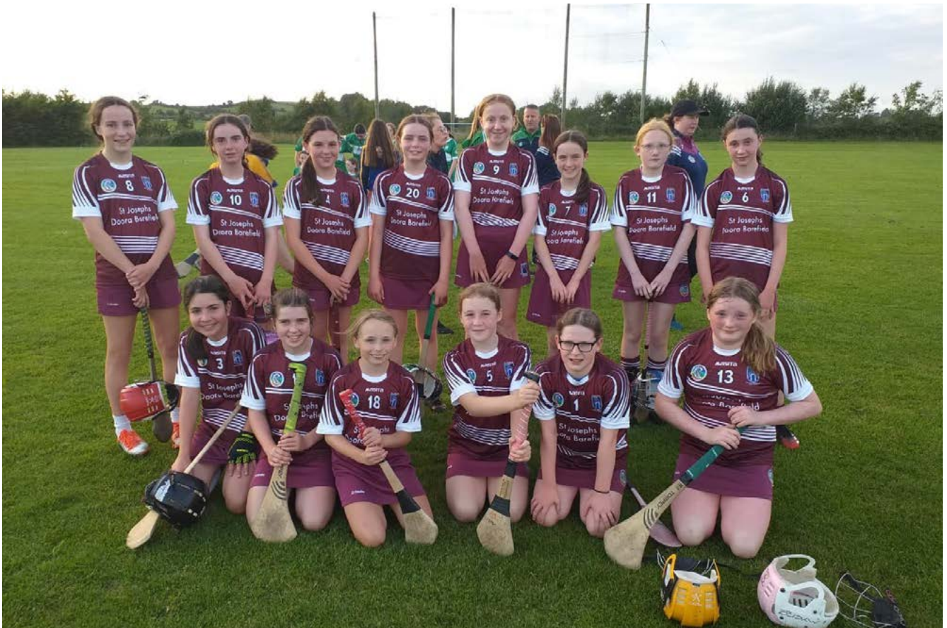
U13 DIV C team

Team 1 consisted of 2011 born players playing in Division 1. These girls got to the final in this tournament and the semi-final in the Marian Keane tournament. Narrowly missing out in both. Team 2 consisted of 2011/2012 born players playing in Division 2. They came up against stiff competition, playing a lot of clubs' 1st team. Our girls showed extreme confidence on the ball in all matches and learned a lot from them.