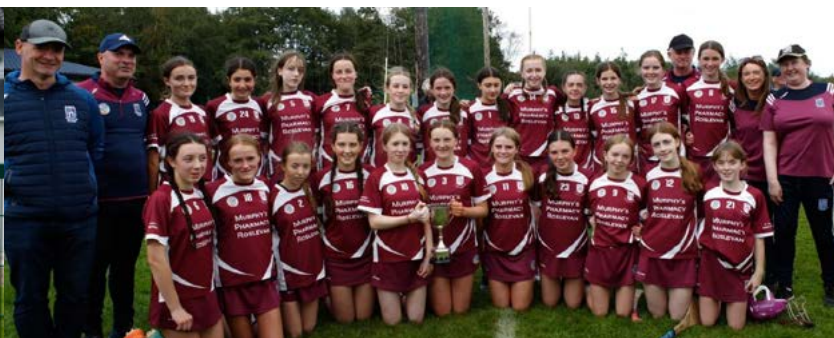
After the game with the Cup