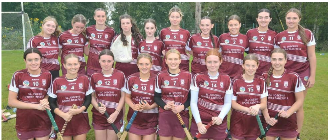
U18 Team Photo ahead of the Shield Final V Kilmaley