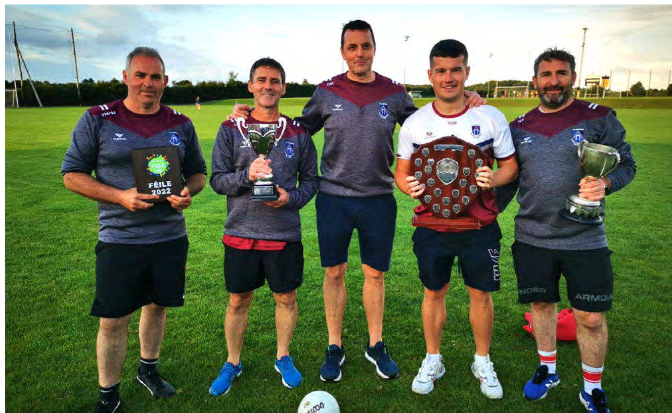
U15 Football Management Team 2022