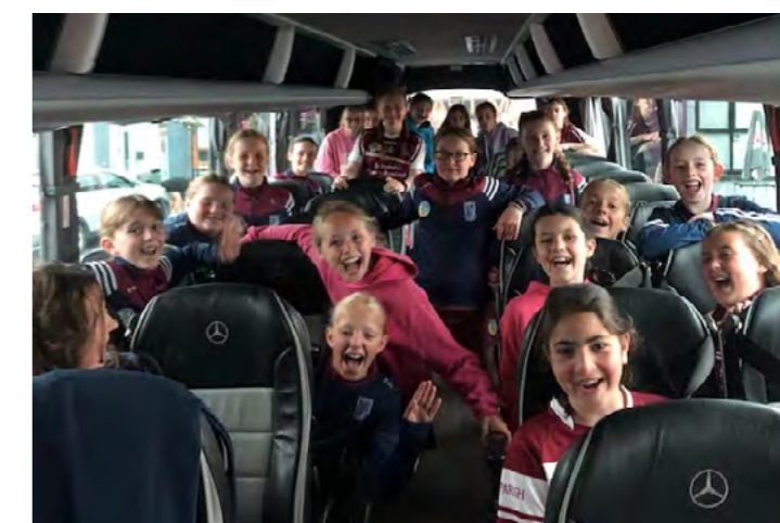
The bus up and down to Dublin was just the best craic !