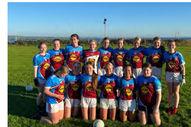
Junior A team

We qualified for a shield final against Fergus Rovers and defeated them by 2 points to win the Shield.