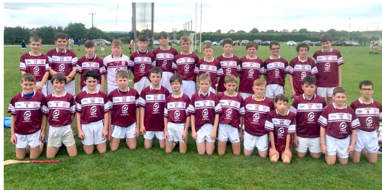
U13 A Academy Shield Winners

On each occasion though, our players learned a little bit more about themselves as hurlers and improved. Players always looked forward to the next game and our training sessions often ran over-time as the boys didn't want the game to end. On a fine evening in July, our U13 Academy team overcame our friends from Sixmilebridge in an epic 8 goal thriller Shield final in Gurteen.