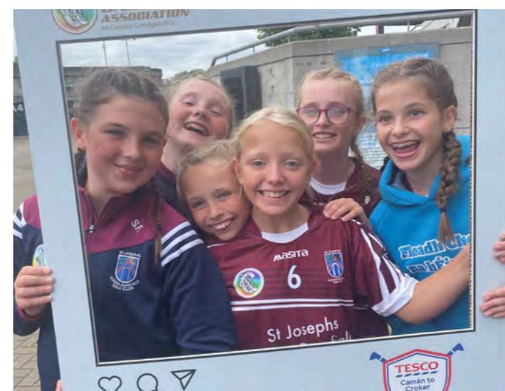
Happy Camogie Players !