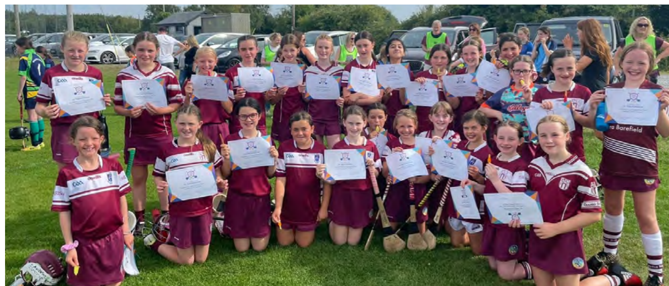
U12s with their Participation Certs at the TESCO Fun Day