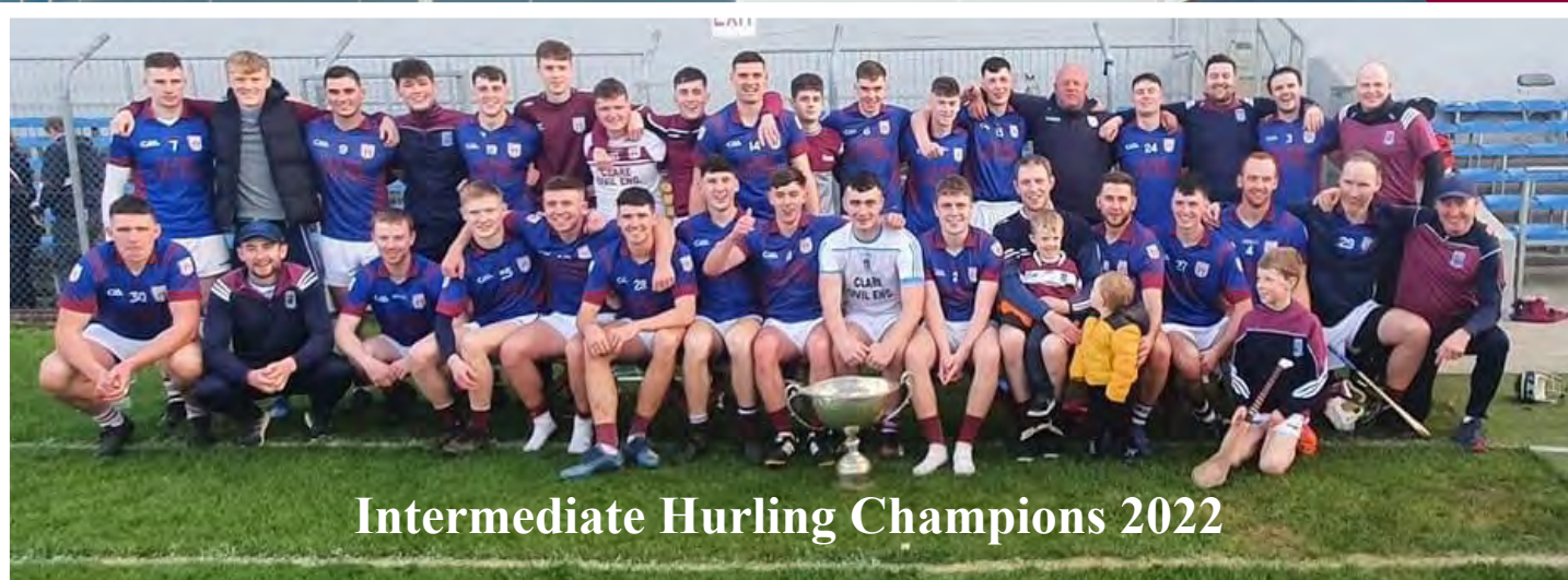
Intermediate Hurling Champions 2022