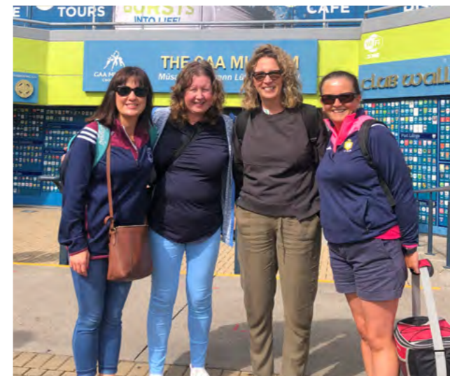
Some of the Coaches ( Right ) and Supervisors ( Left ) who organised the trip and managed everything so well on the day.