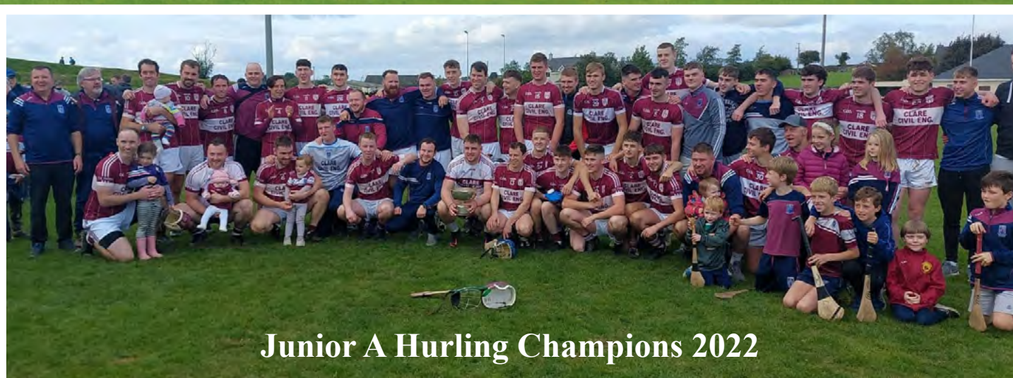
Junior A Hurling Champions 2022