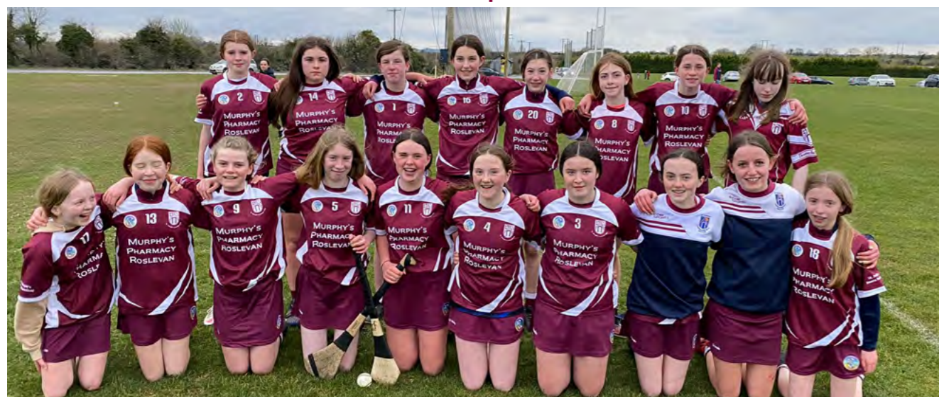
U14 team picture