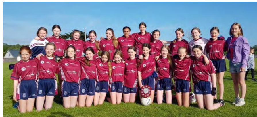
U14 League Division 4 winners

The membership during the year was in excess of 45 members and training in the year commenced in January 2022.