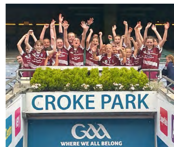
Hopefully, these great players will be back at this spot some day in the future collecting a cup !