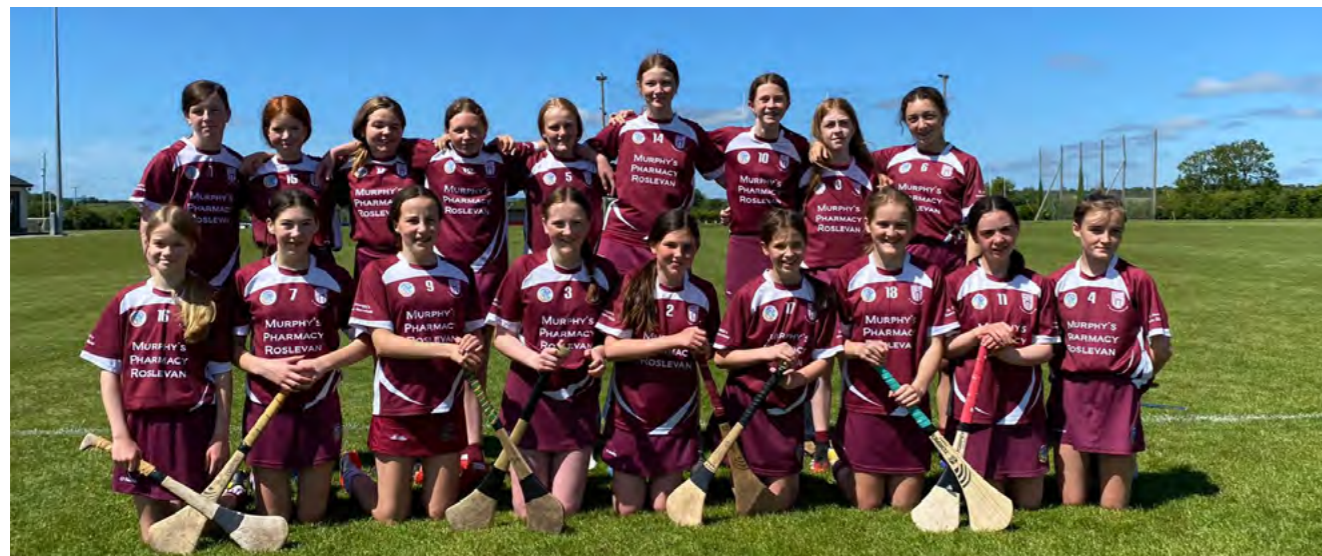
U14 team picture