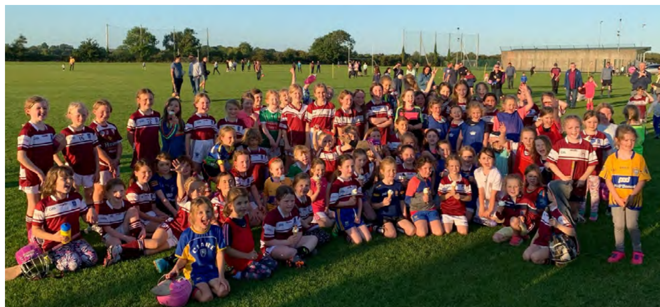
U8s... just before they got the ice-cream cones!