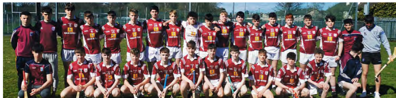
U17 minor a hurling county finalist

The Minor championship commenced in July and over a two month period we played seven championship games at the end of which we finished 2nd in the table behind Clooney Quin. This meant we qualified for the semi-final against Clarecastle and this game was played in Newmarket in late September. This was an excellent game of hurling with the lads playing really well to win by 5 points. We then met Clooney Quin in the Minor Championship final which was played on 9th October in Cusack Park. The weather was miserable on the day as it rained persistently all through the match and conditions were really difficult. However both teams put in a tremendous battle and the game was level at full time which meant extra time.