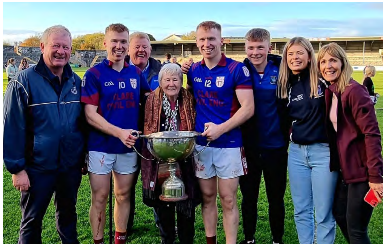
3 generations of the Hannon family celebrating in Cusack Park