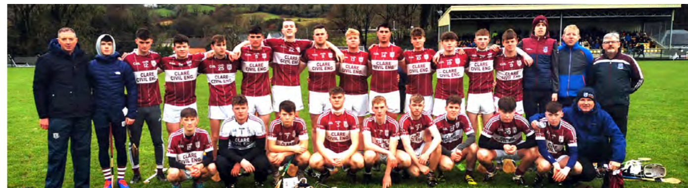
U21 c county hurling finalists 2022