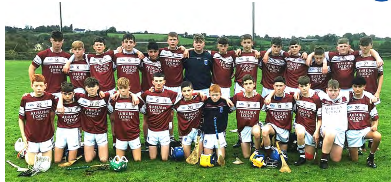
U13 A Finalists