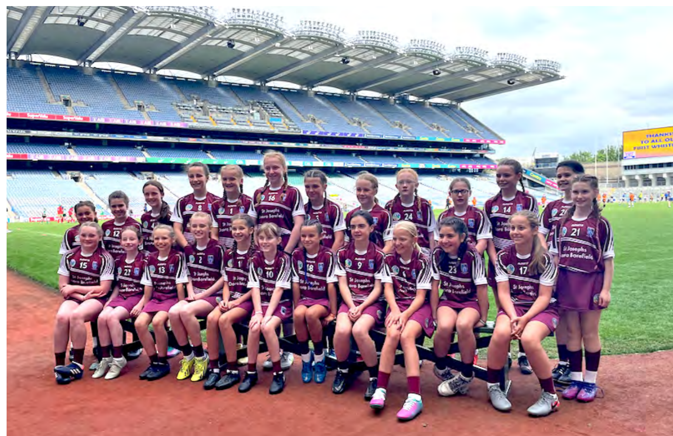
(Great picture of the players at the pitch with Croke Park backdrop in all its glory)