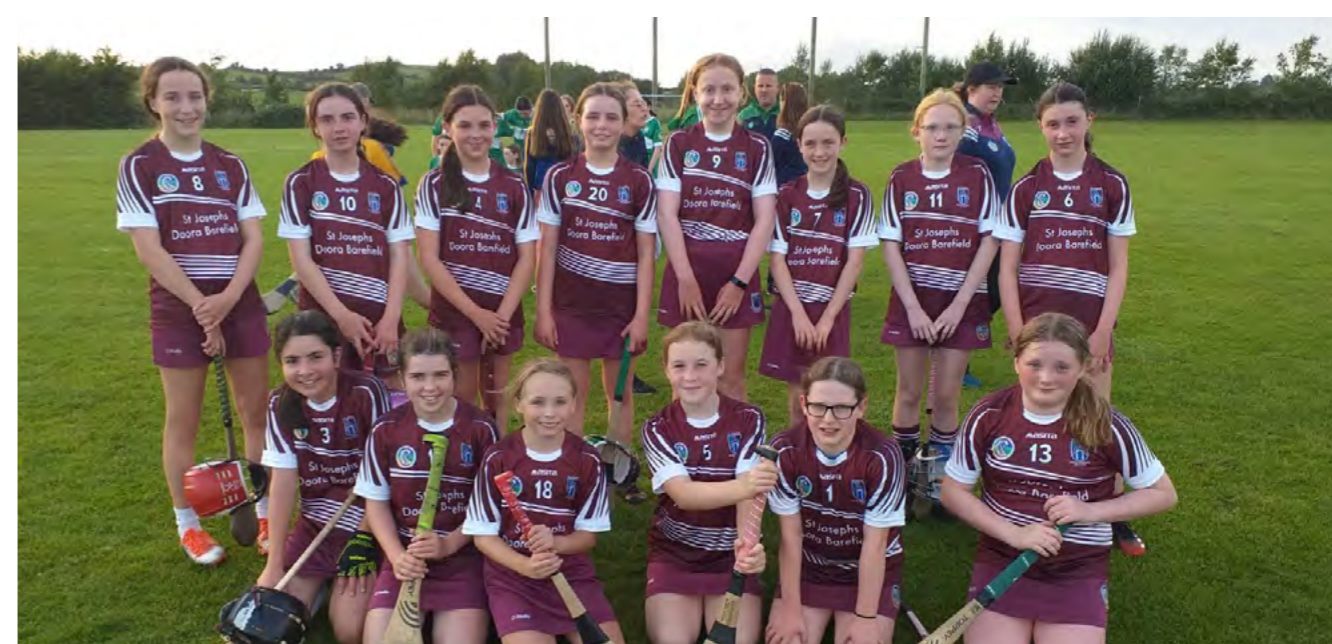
U13 DIV C team

Our Academy team had victories over Cratloe and Sixmilebridge in all their games. Overall, we saw fantastic improvements in all the girls' skills as the season progressed.