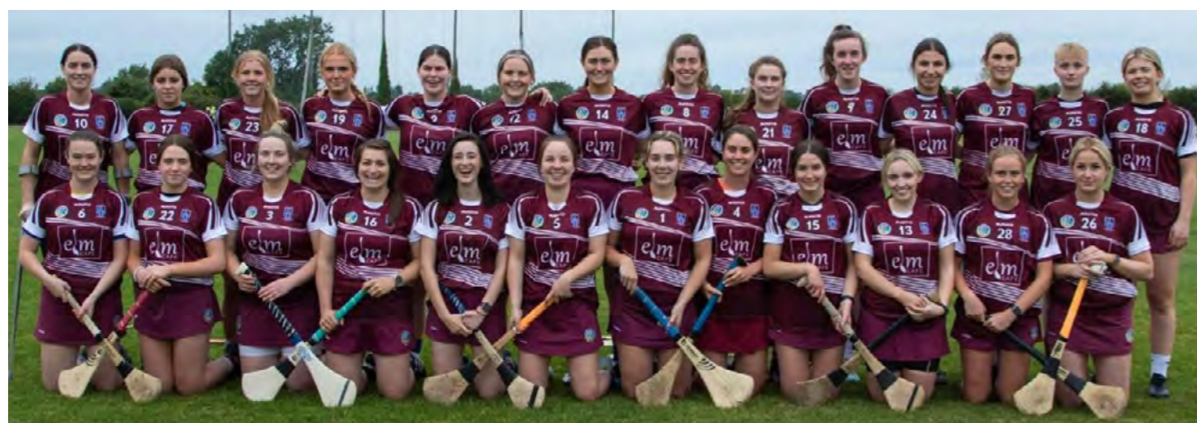
Full Adult Panel 2022