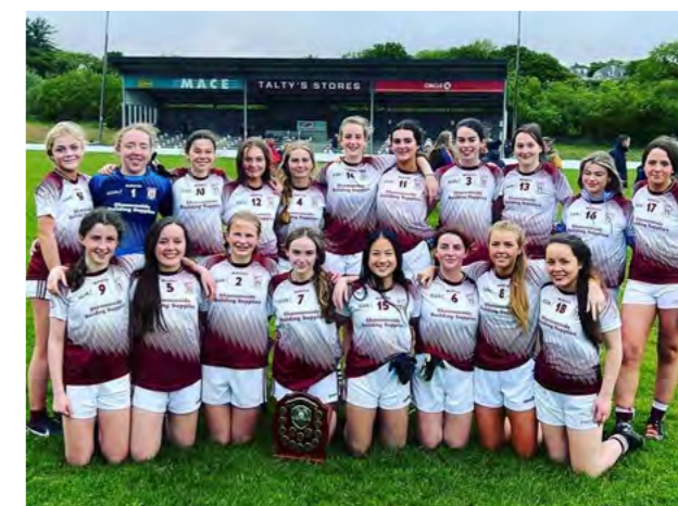
U16A Shield winners